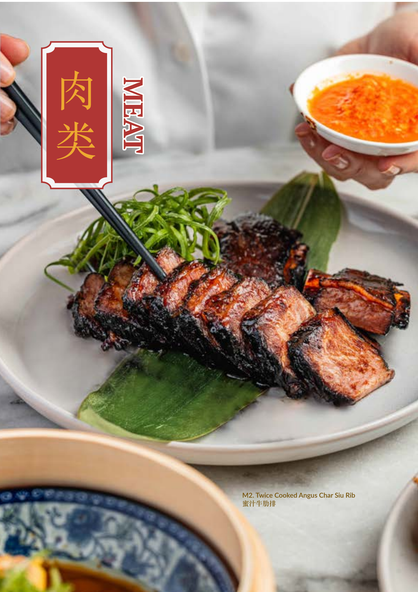
M2. Twice Cooked Angus Char Siu Rib 蜜汁牛肋排