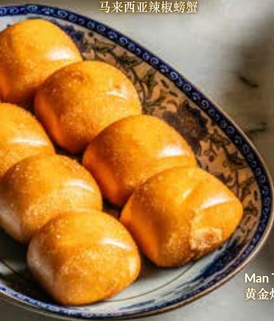
Man Tau (8 pieces) 黄金炸馒头