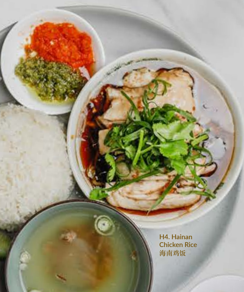
H4. Hainan Chicken Rice 海南鸡饭