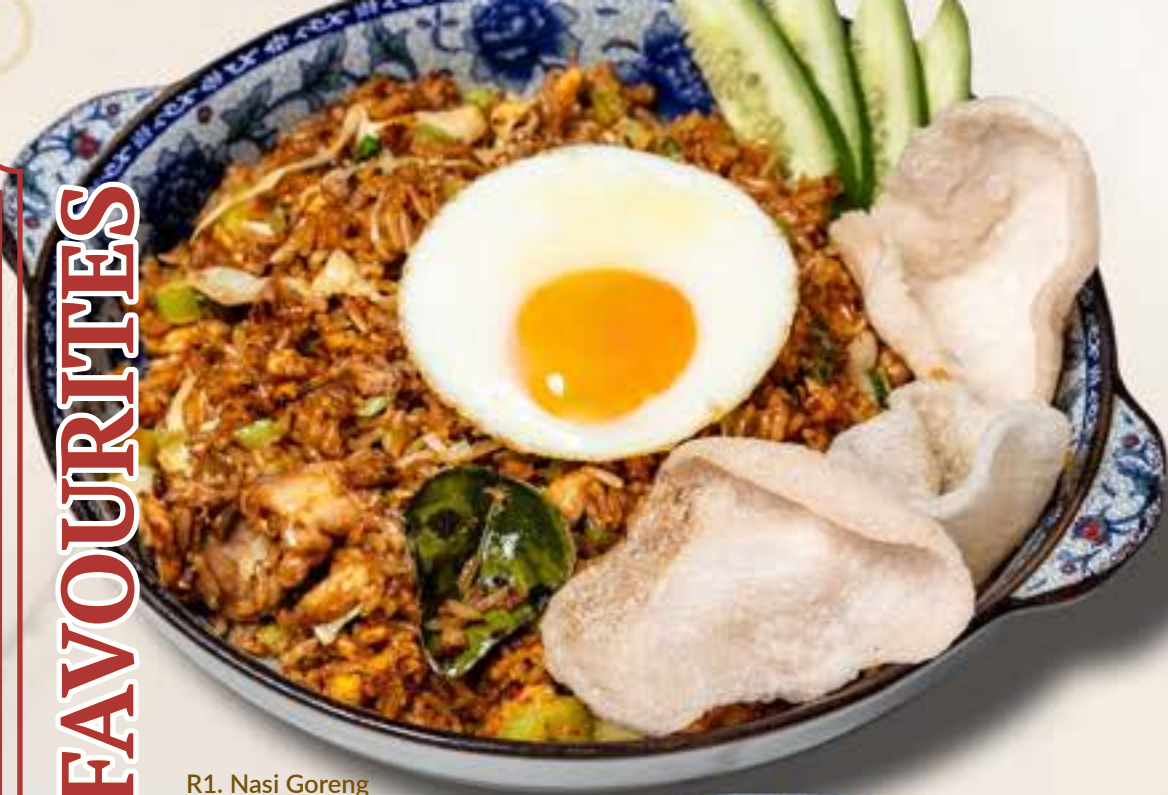
R1. Nasi Goreng 马来炒饭