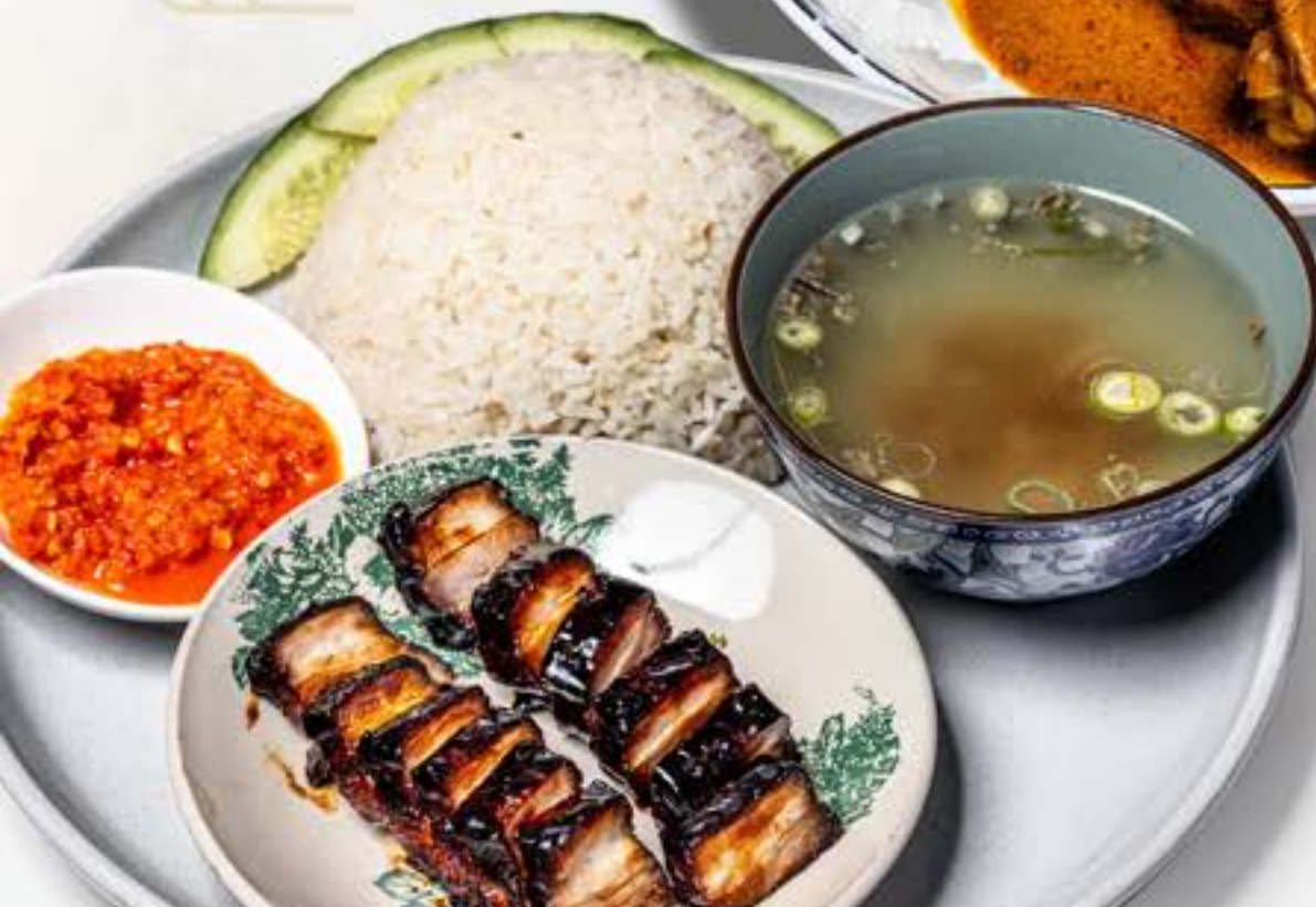
R3. Char Siu Rice 蜜汁叉烧饭