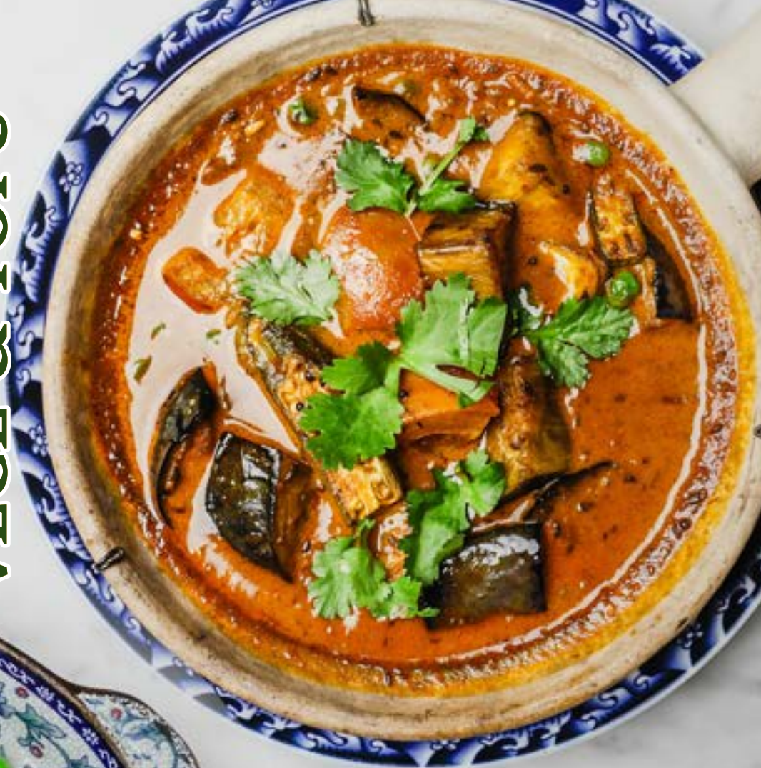
V4. Tumeric Curry Vegetables 咖喱菜