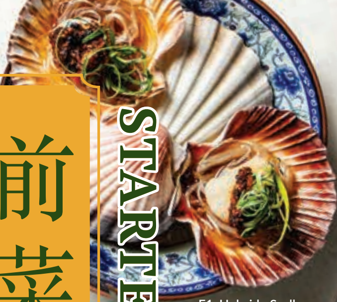
E1. Hokaido Scallop 粉丝蒸扇贝