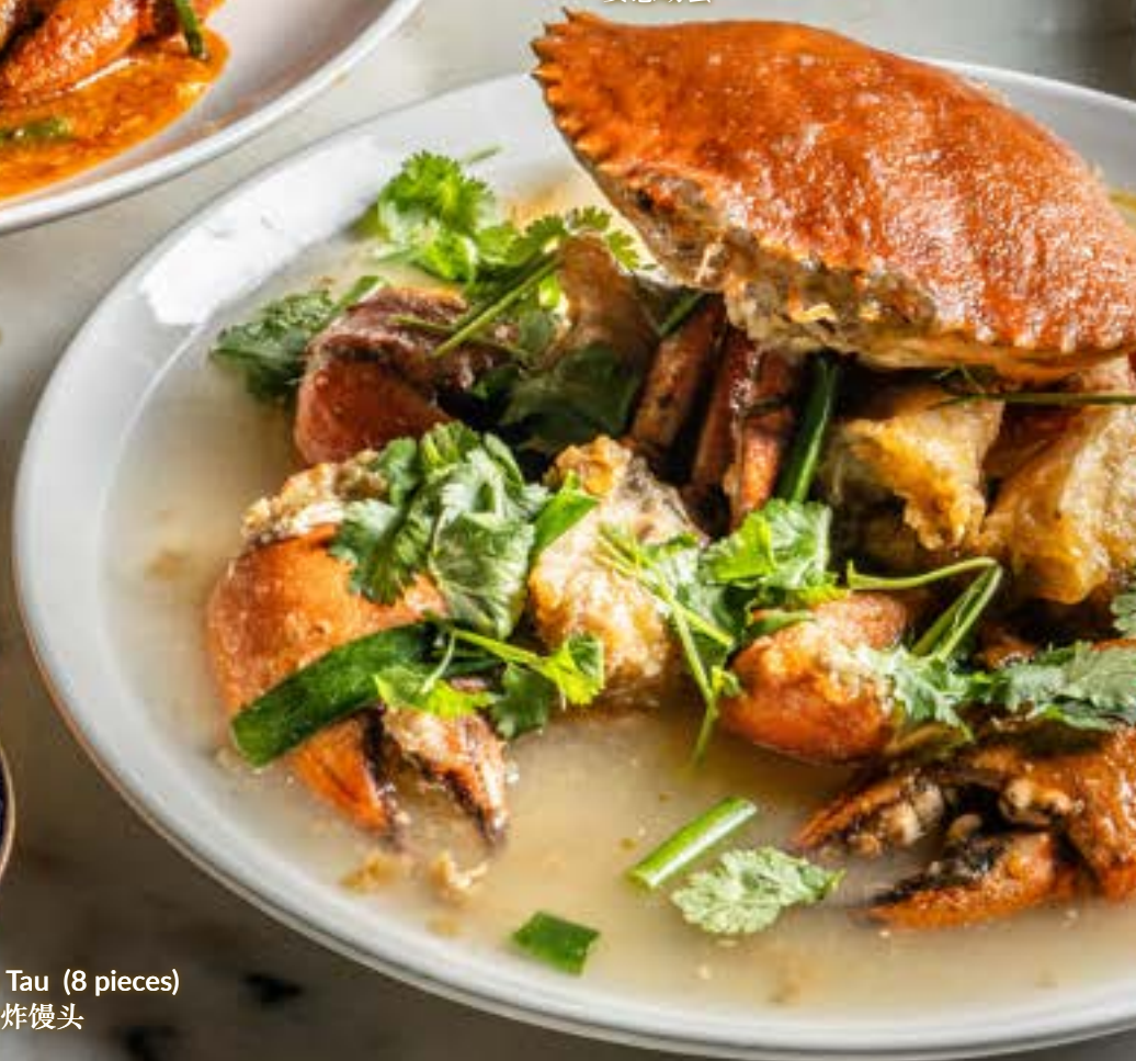
LS3. Ginger Shallot Mud Crab 姜葱螃蟹