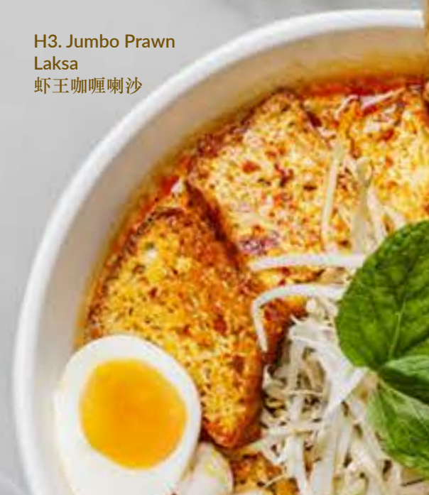
H3. Jumbo Prawn Laksa 虾王咖喱喇沙