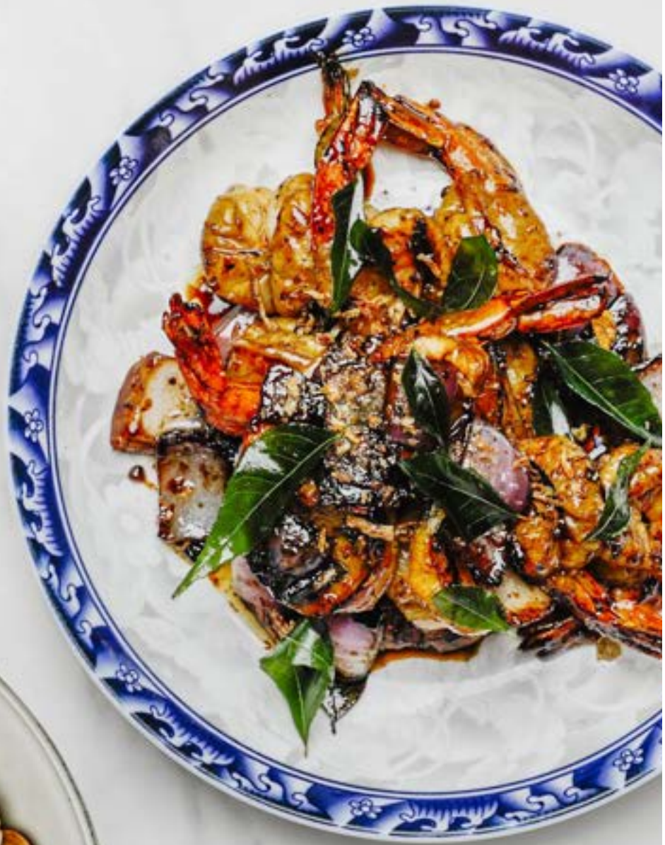
S1. Black Pepper Prawns 砂拉越黑椒咖喱虾王