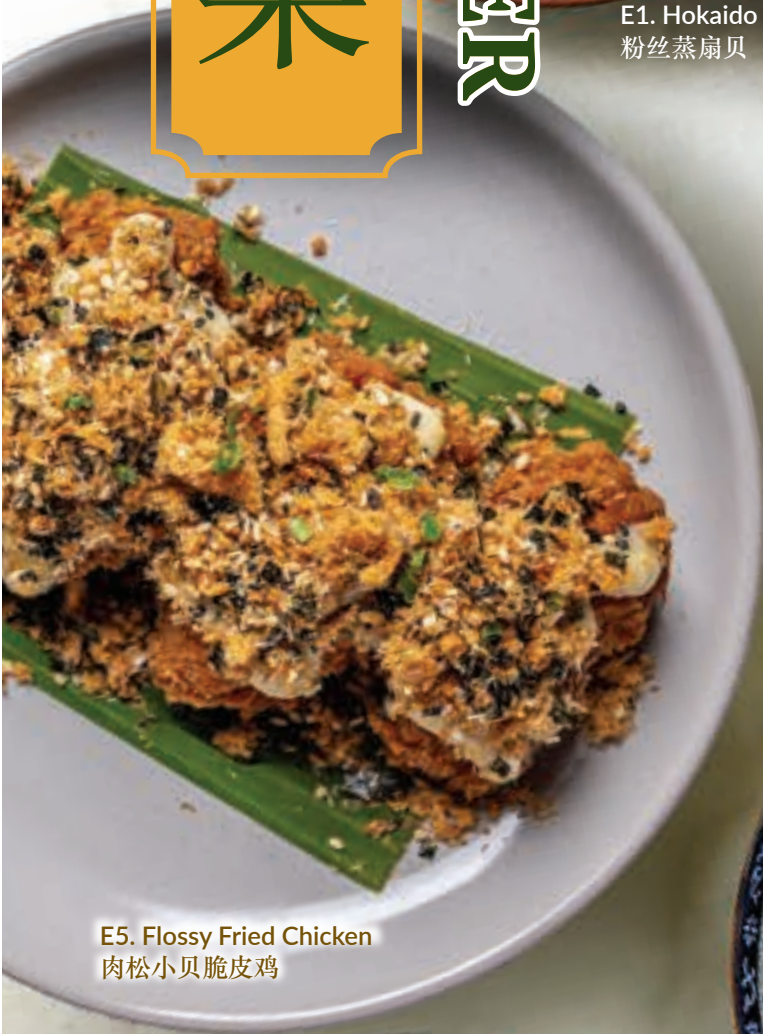
E5. Flossy Fried Chicken 肉松小贝脆皮鸡