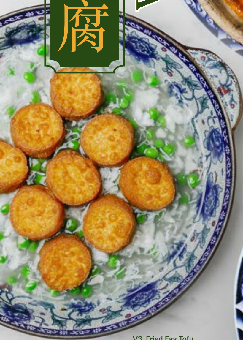
V3. Fried Egg Tofu 上汤蟹肉烩蛋豆腐