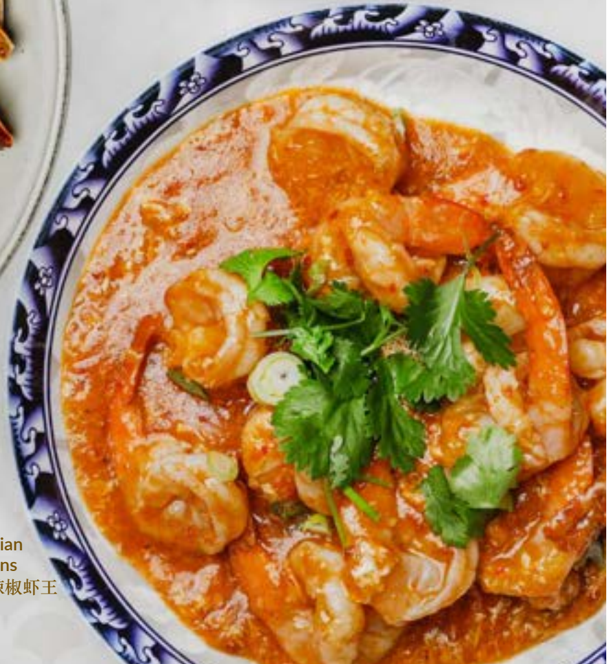
S3. Malaysian Chilli Prawns 马来西亚辣椒虾王