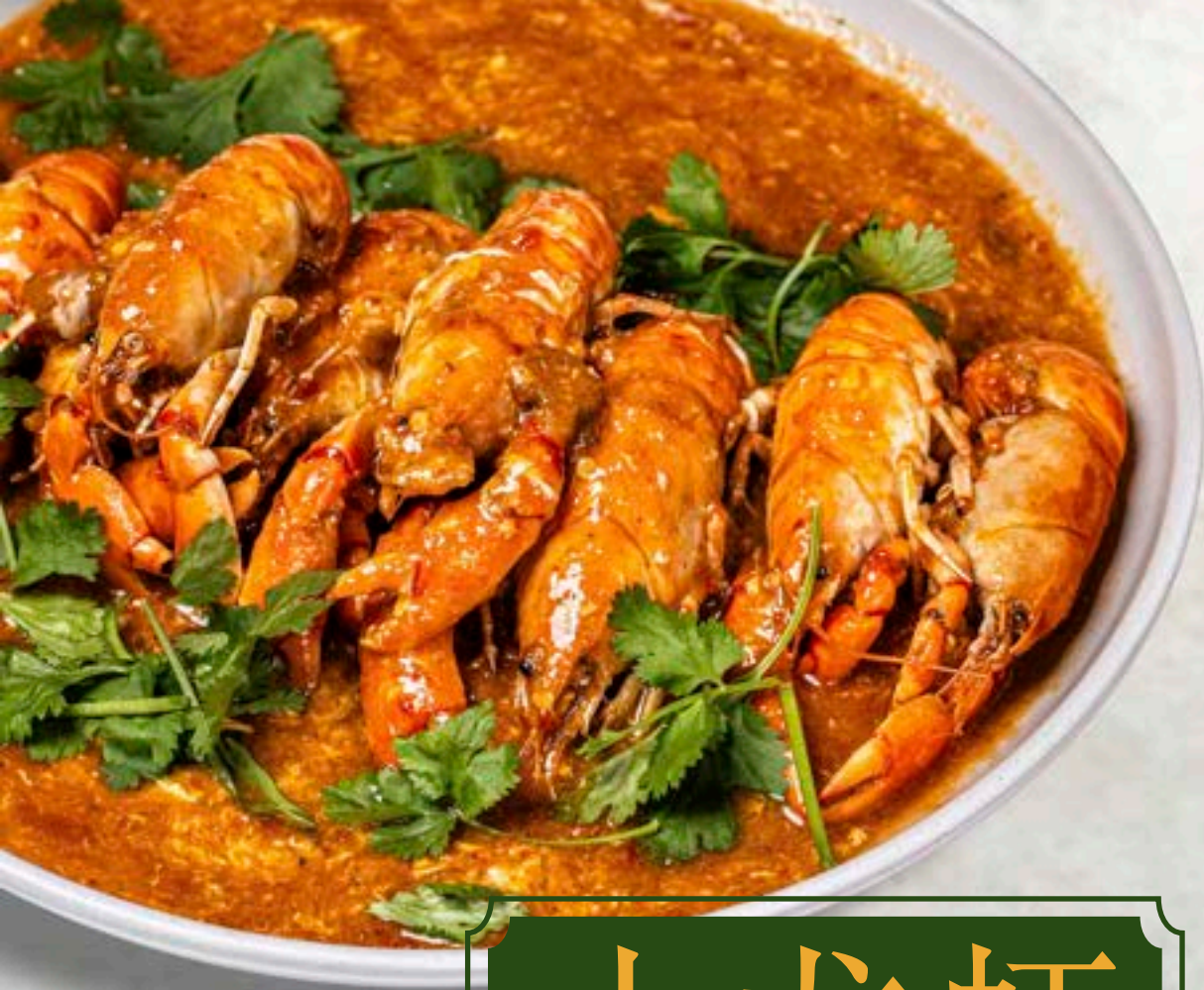
XLX1. Malaysian Chilli Crayfish 马来西亚辣椒小龙虾