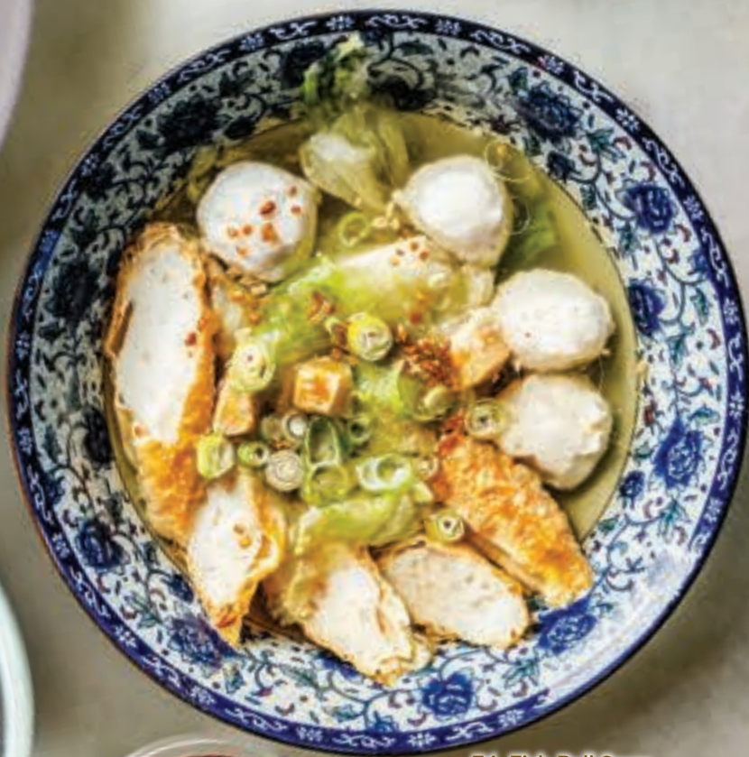
E4. Fish Ball Soup 阿嬷招牌手工马鲛鱼丸汤