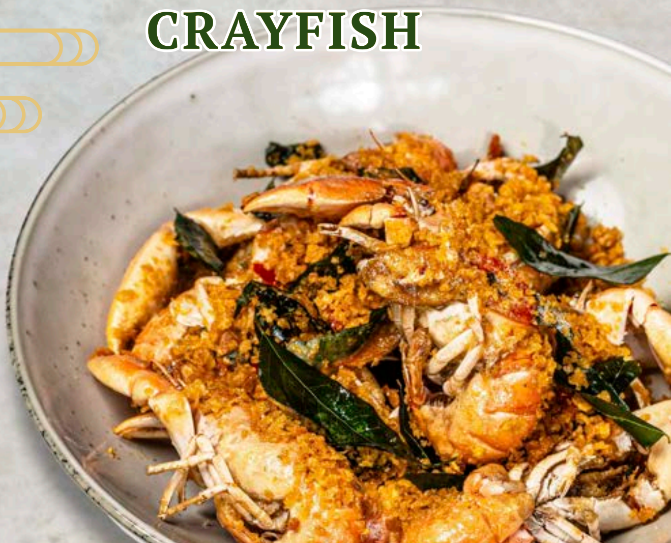
XLX2. Salted Duck Egg Cereal Crayfish 避风塘金沙咸蛋小龙虾黄