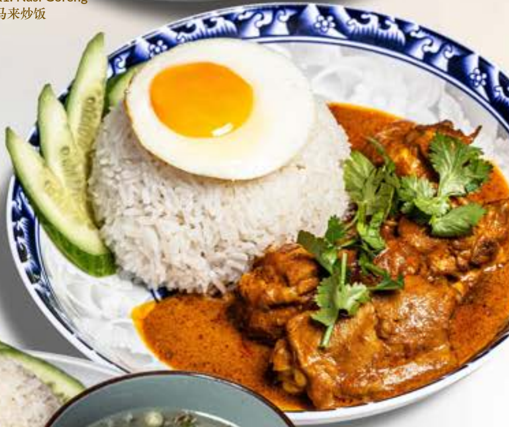
R2. Chicken Curry Rice 咖喱鸡饭