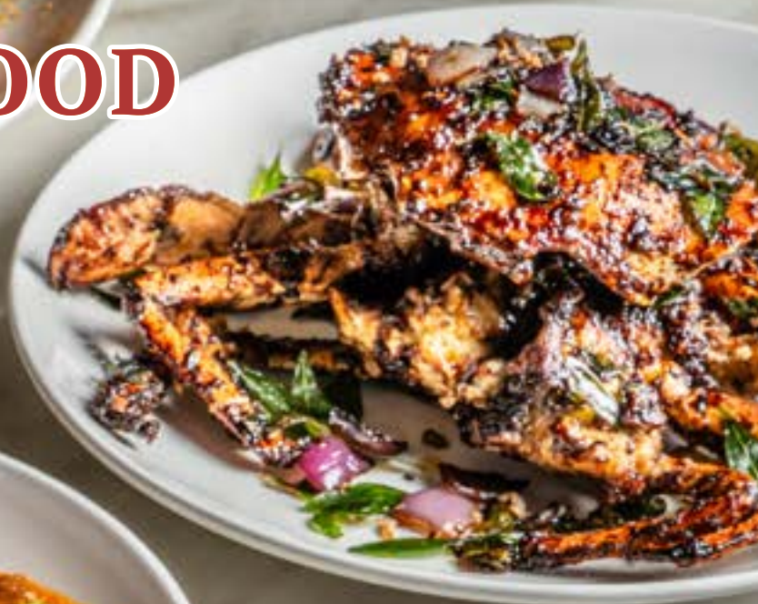
LS4. Black Pepper Curry Mud Crab 阿嬷砂拉越黑椒咖喱螃蟹