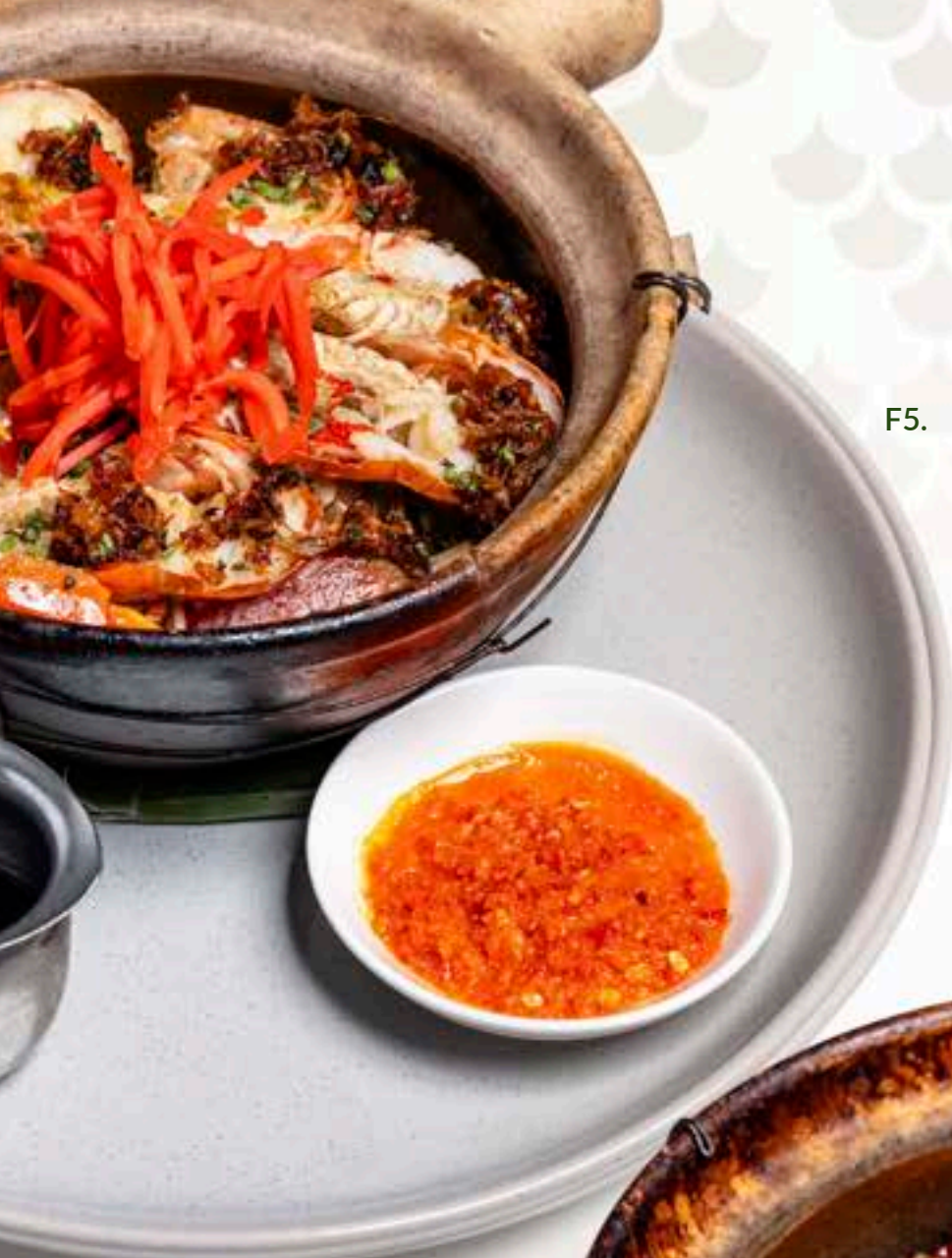
F5. XO Crayfish Claypot Rice 🐞 Crayfish, Claypot Rice, XO Sauce XO小龙虾煲仔饭 39