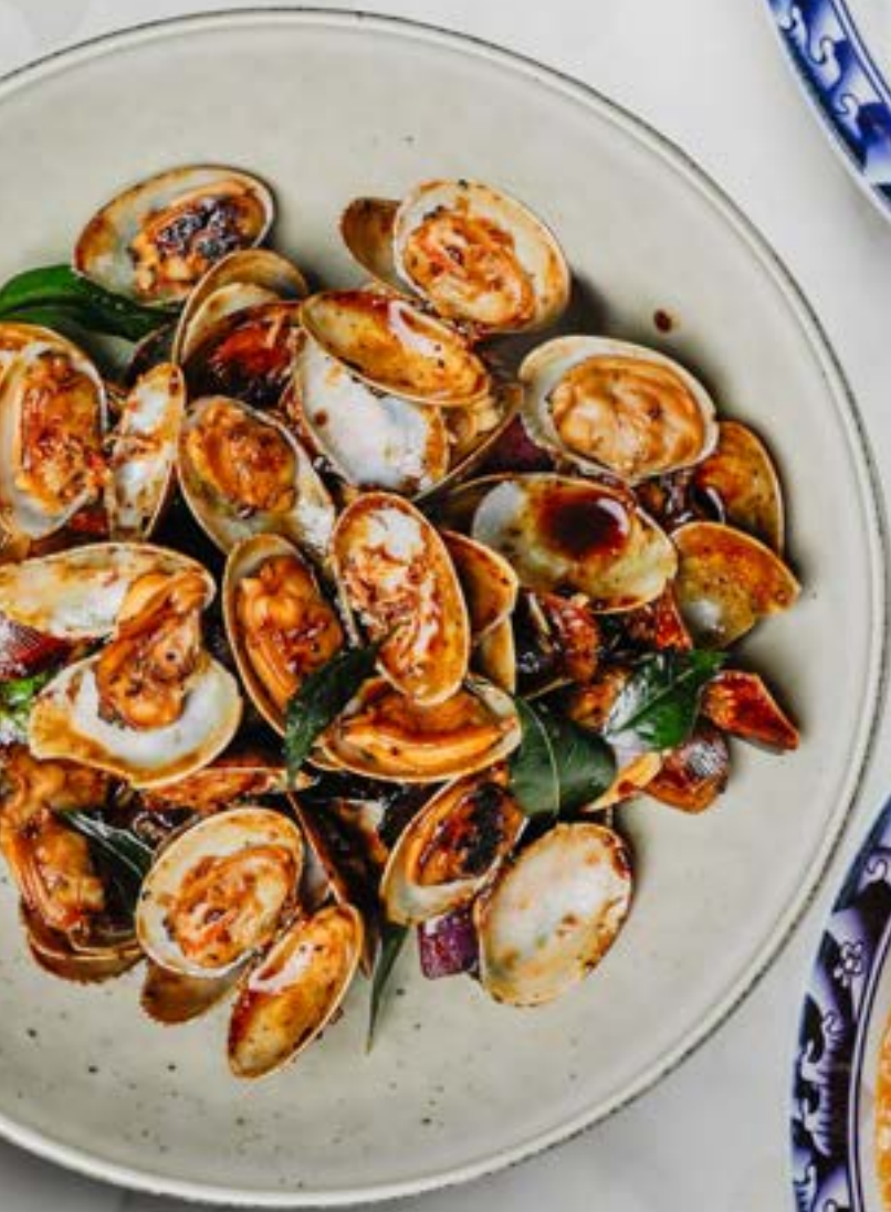
S6. Black Pepper Clam 砂拉越黑椒咖喱花蛤