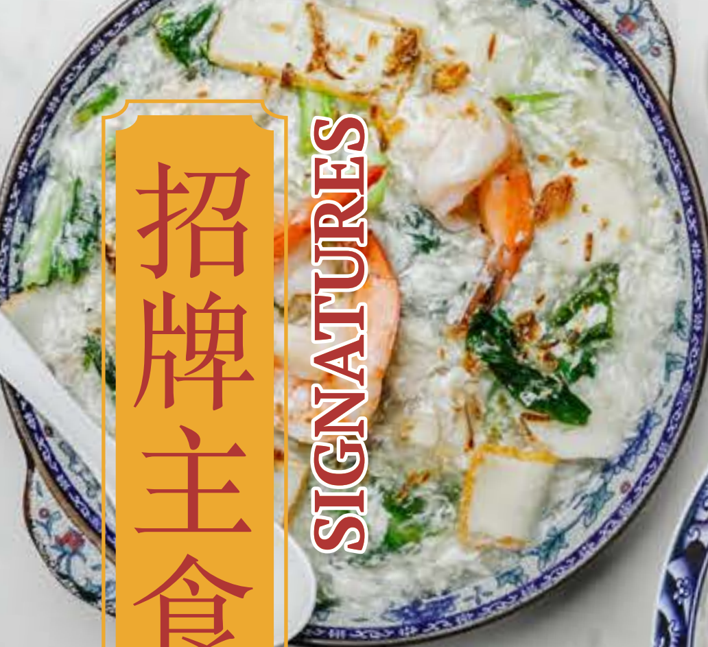
H6. Char Hor Fun 海鲜和鸡肉滑蛋炒河