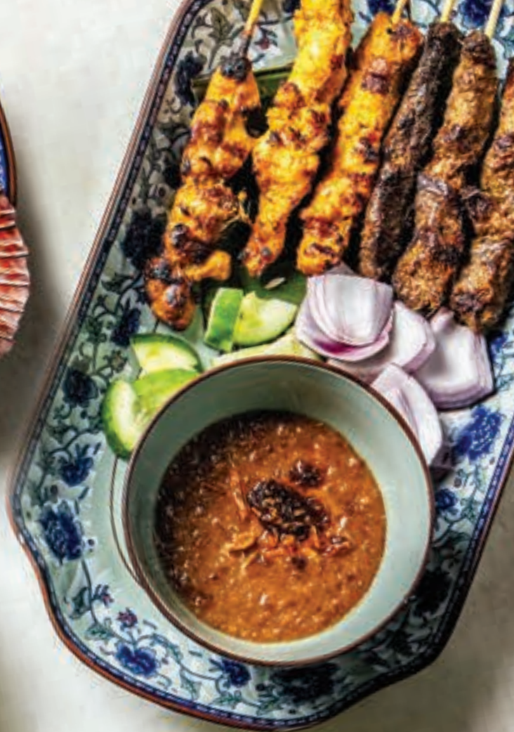
E3. Mix & Match Satay 和牛和鸡柳烤串