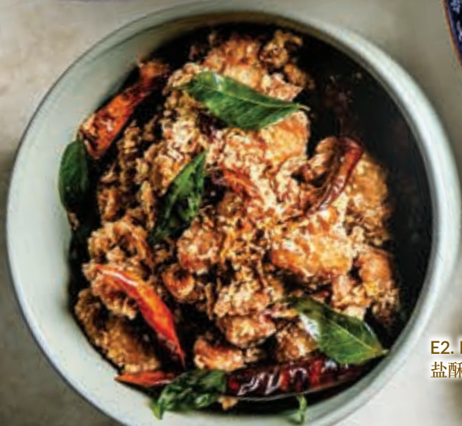
E2. Indomie Popcorn Chicken 盐酥鸡米花