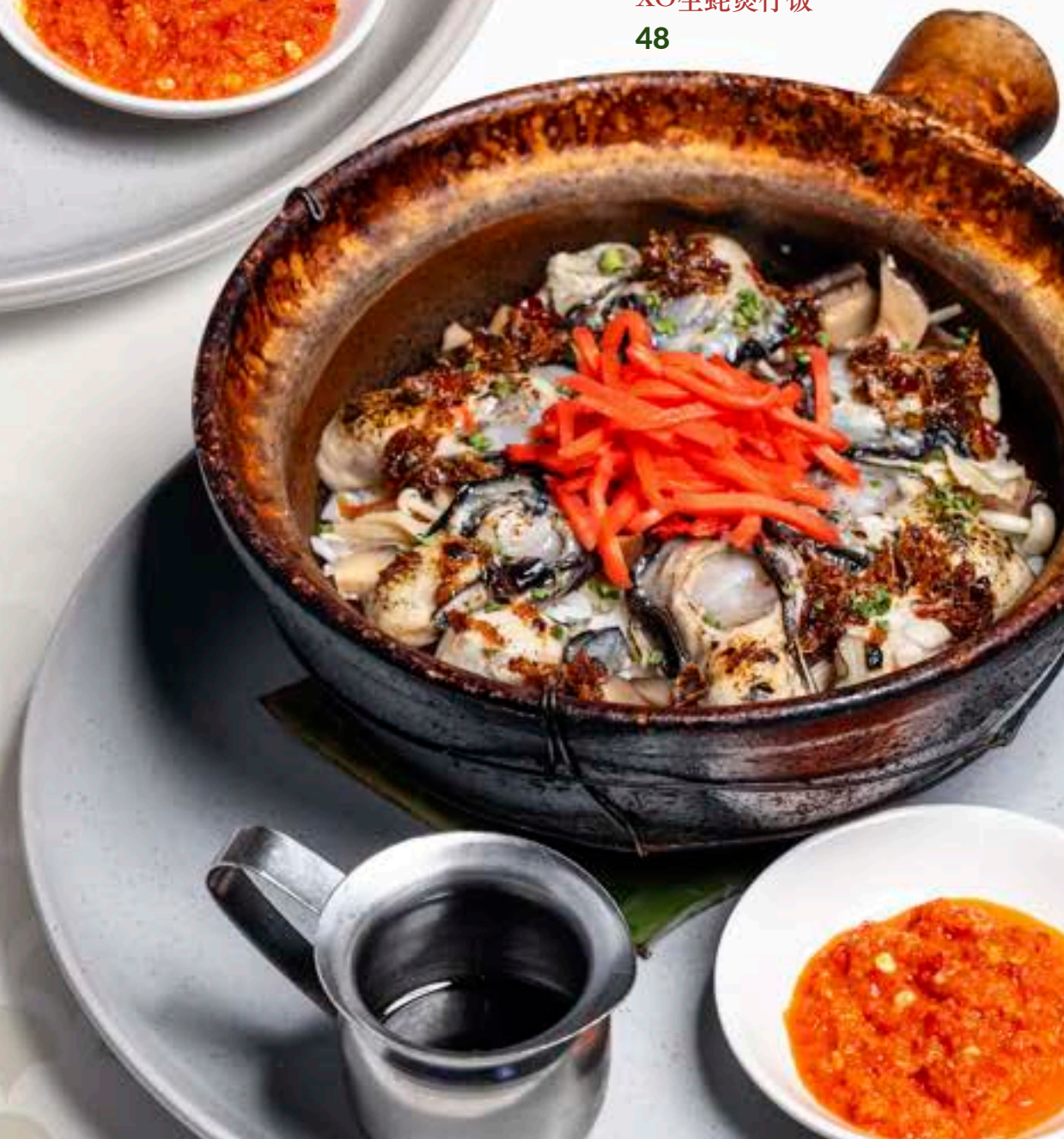
F5. XO Oyster Claypot Rice 🐞 Grilled pacific Oysters, Claypot Rice, XO Sauce XO生蚝煲仔饭 48