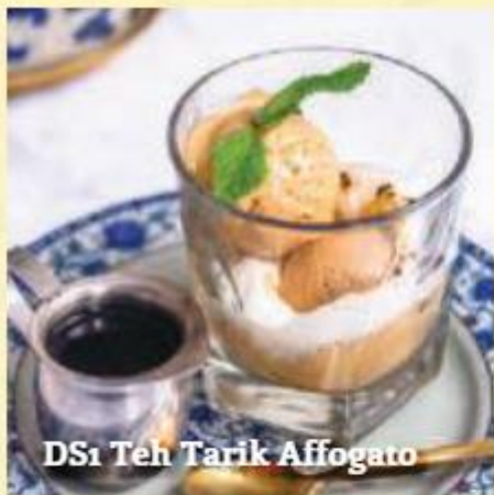
DS1. Teh Tarik Affogato