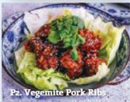
P2. Vegemite Pork Ribs