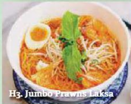
H3. Jumbo Prawns Laksa