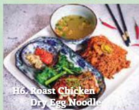
H6. Roast Chicken Dry Egg Noodle