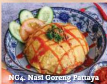
NG4 Nasi Goreng Pattaya