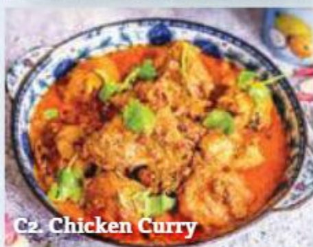
C2. Chicken Curry