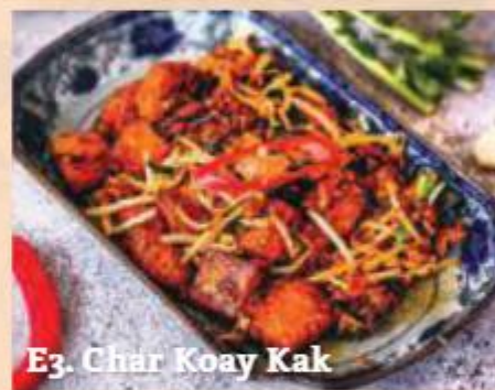
E3. Char Koay Kak