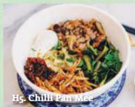
H5. Chilli Pan Mee