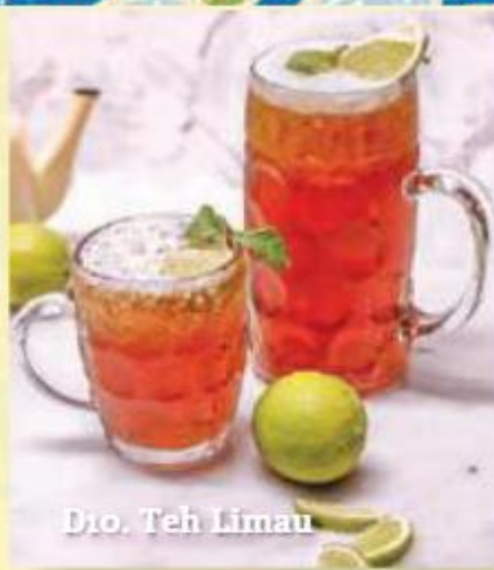
D10. Teh Limau

Please inform our staff of any food allergies or special dietary requirements. We try our best to cater to dietary requirements. We do not guarantee any of our dishes to be 100% allergen free. Traces of allergen may be present in any of our dishes.