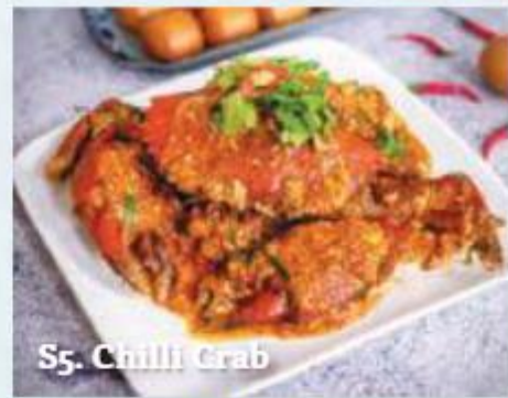
S5. Chilli Crab

Please inform our staff of any food allergies or special dietary requirements. We try our best to cater to dietary requirements. We do not guarantee any of our dishes to be 100% allergen free. Traces of allergen may be present in any of our dishes.