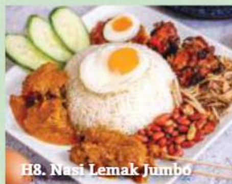
H8. Nasi Lemak Jumbo