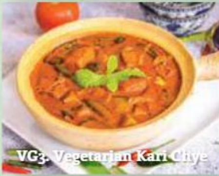
VG3. Vegetarian Kari Chye