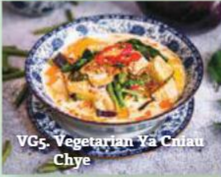
VG5. Vegetarian Ya Cniau Chye