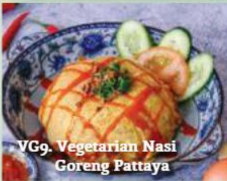
VG9. Vegetarian Nasi Goreng Pattaya