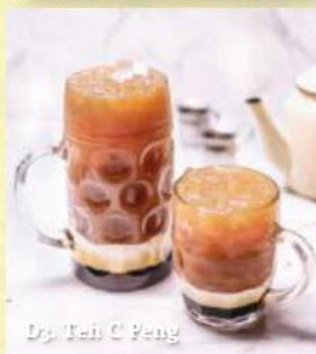
D3. Teh C Peng