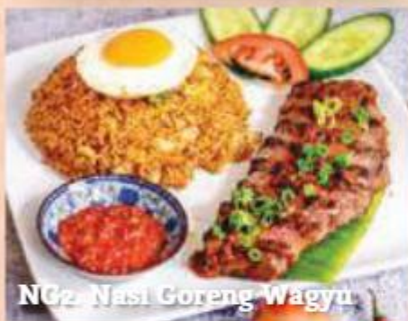
NG2 Nasi Goreng Wagyu