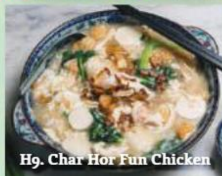
H9. Char Hor Fun Chicken

Please inform our staff of any food allergies or special dietary requirements. We try our best to cater to dietary requirements. We do not guarantee any of our dishes to be 100% allergen free. Traces of allergen may be present in any of our dishes.