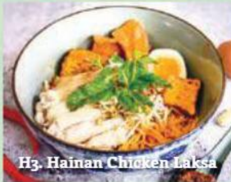
H3. Hainan Chicken Laksa