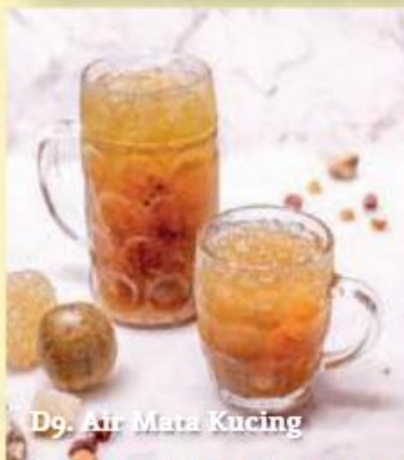
D9. Air Mata Kucing