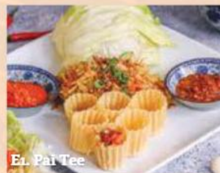
E1. Pai Tee

Please inform our staff of any food allergies or special dietary requirements. We try our best to cater to dietary requirements. We do not guarantee any of our dishes to be 100% allergen free. Traces of allergen may be present in any of our dishes.