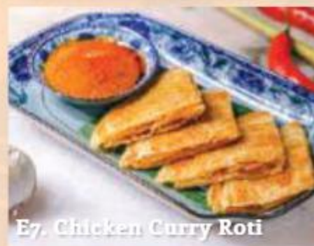
E7. Chicken Curry Roti