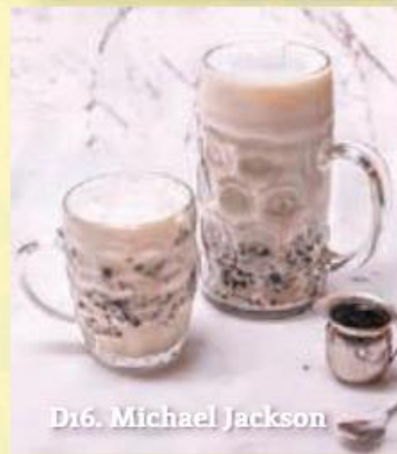
D16. Michael Jackson