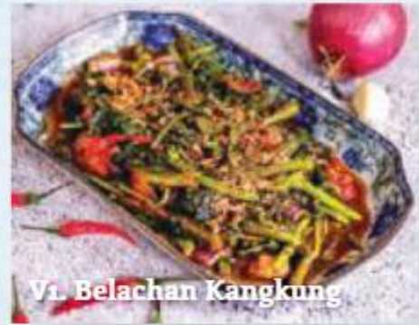
V1. Belachan Kangkung