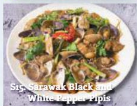
S15. Sarawak Black and White Pepper Pipis