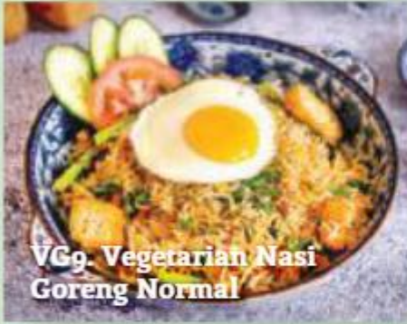
VG9. Vegetarian Nasi Goreng Normal