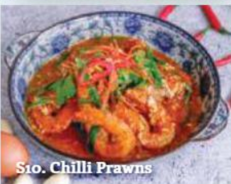
S10. Chilli Prawns