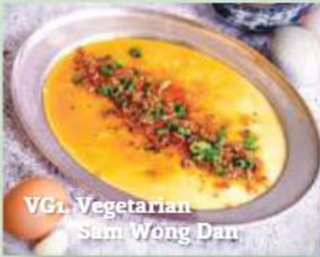
VG1. Vegetarian Sam Wong Dan