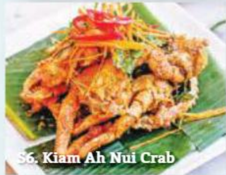
S6. Kiam Ah Nui Crab