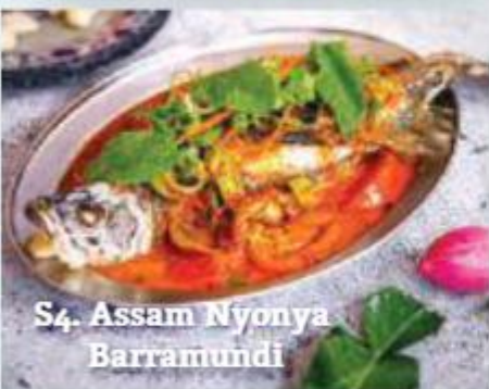
S4. Assam Nyonya Barramundi