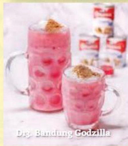
D13. Bandung Godzilla