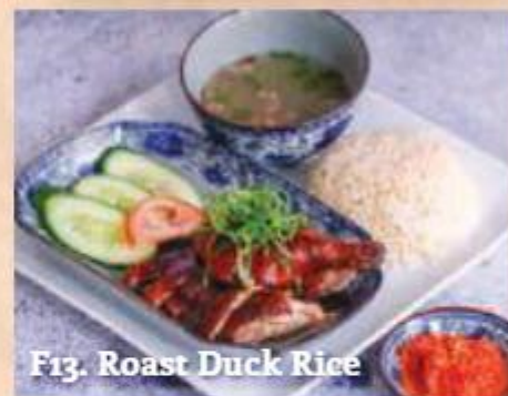
F13. Roast Duck Rice