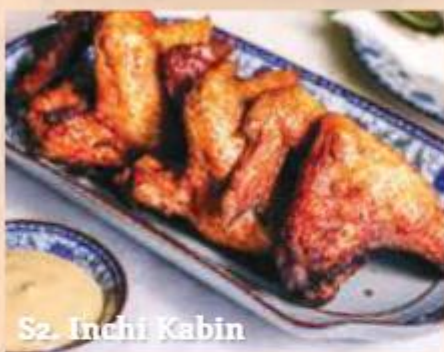
S2. Inchi Kabin