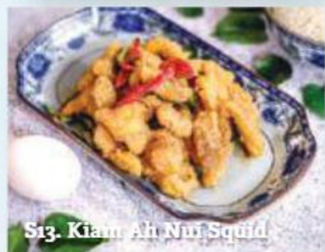
S13. Kiam Ah Nui Squid