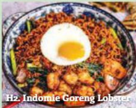
H2. Indomie Goreng Lobster