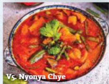
V5. Nyonya Chye

Please inform our staff of any food allergies or special dietary requirements. We try our best to cater to dietary requirements. We do not guarantee any of our dishes to be 100% allergen free. Traces of allergen may be present in any of our dishes.