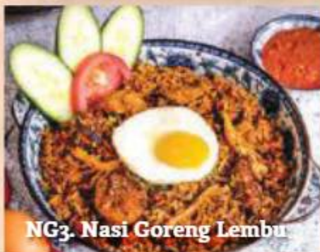
NG3 Nasi Goreng Lembu