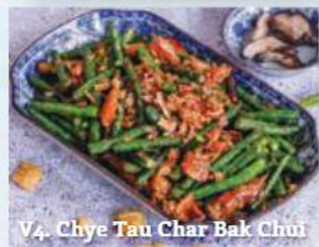
V4. Chye Tau Char Bak Chui