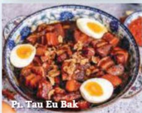
P1. Tau Eu Bak