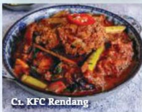
C1. KFC Rendang