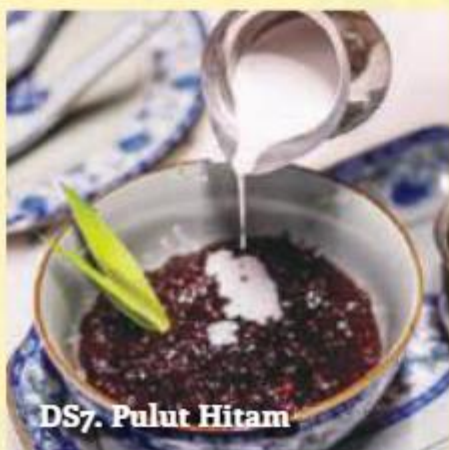
DS7. Pulut Hitam