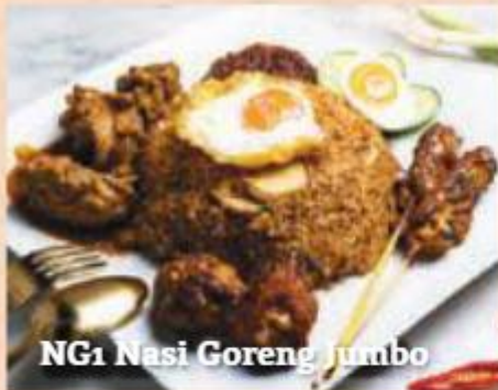
NG1 Nasi Goreng Jumbo