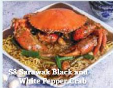
S8 Sarawak Black and White Pepper Crab