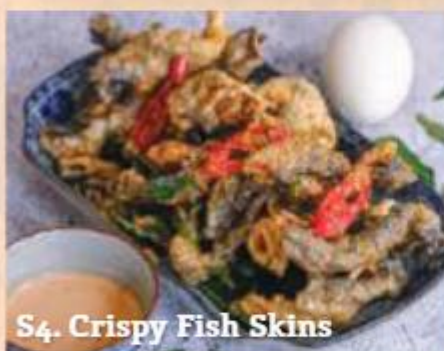
S4. Crispy Fish Skins