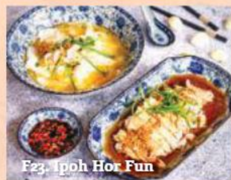
F23. Ipoh Hor Fun

Please inform our staff of any food allergies or special dietary requirements. We try our best to cater to dietary requirements. We do not guarantee any of our dishes to be 100% allergen free. Traces of allergen may be present in any of our dishes.