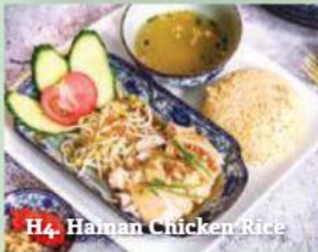
H4. Hainan Chicken Rice