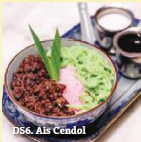
DS6. Ais Cendol