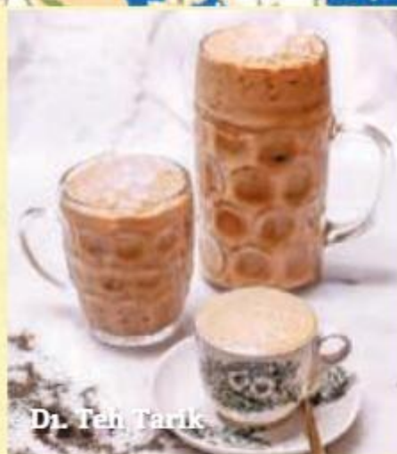
D1. Teh Tarik