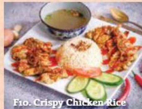
F10. Crispy Chicken Rice