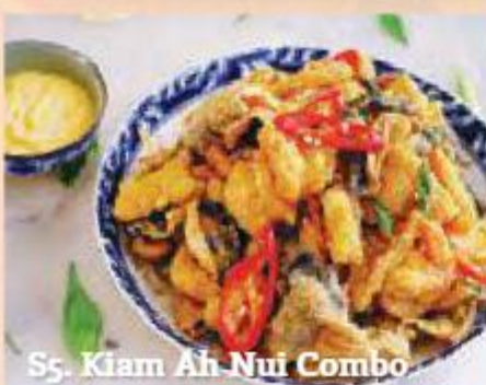
S5. Kiam Ah Nui Combo