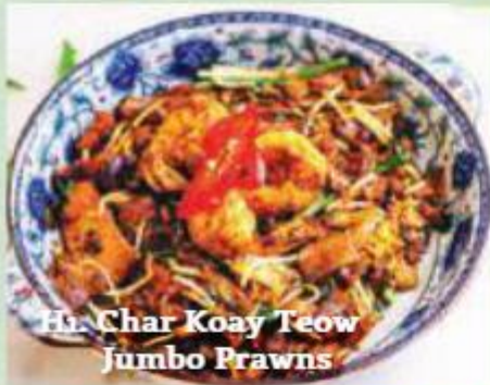
H1. Char Koay Teow Jumbo Prawns