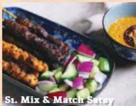
S1. Mix & Match Satay