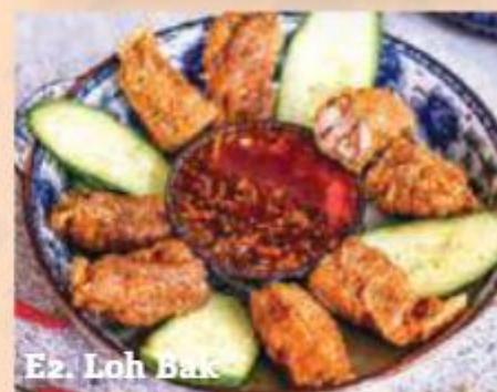
E2. Loh Bak