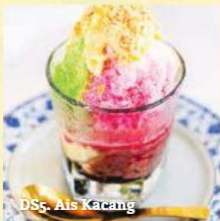
DS5. Ais Kacang