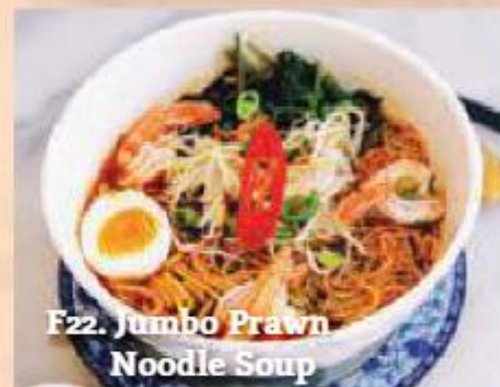
F22. Jumbo Prawn Noodle Soup